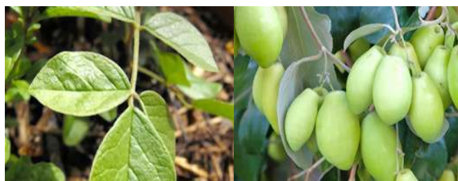
Glycyrrhiza uralensis Chinese licorice 甘草