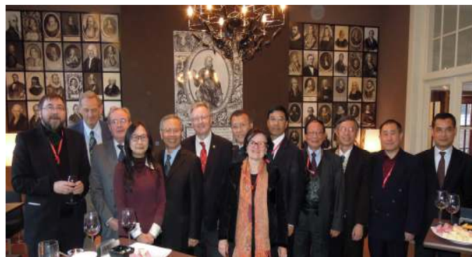
Reception and dinner at Faculty Club of Leiden University for speakers and sponsors of the GP-TCM Congress