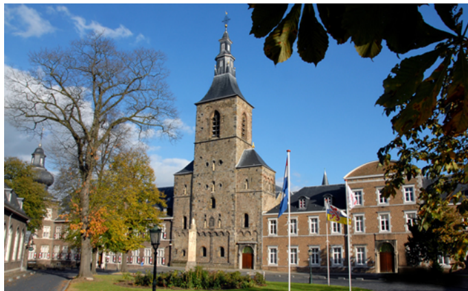
Conference Centre Rolduc, Kerkrade, the Netherlands

4. The GP-TCM Final Conference will be held in Kerkrade, the Netherlands, on 12 th – 13 th April 2012.