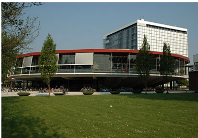
Gorlaeus Laboratories, Leiden, the Netherlands