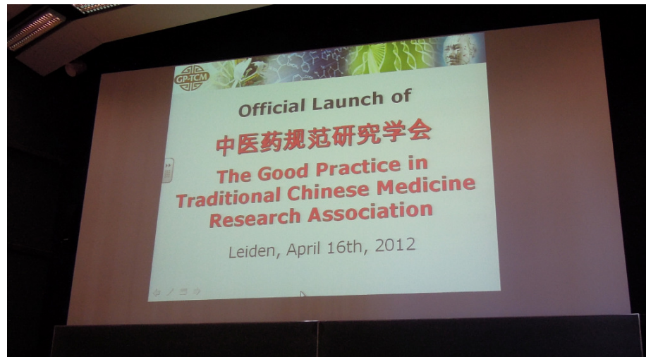
Figure 2: Official launch of the GP-TCM RA during the GP-TCM Congress, Leiden, the Netherlands

The Association was officially launched by its inaugural President Prof. Rudolph Bauer on 16 th April 2012 during 1 st day of the public dissemination event “the GP-TCM Congress”, which took place in Leiden, the Netherlands on 16 th – 18 th April 2012.